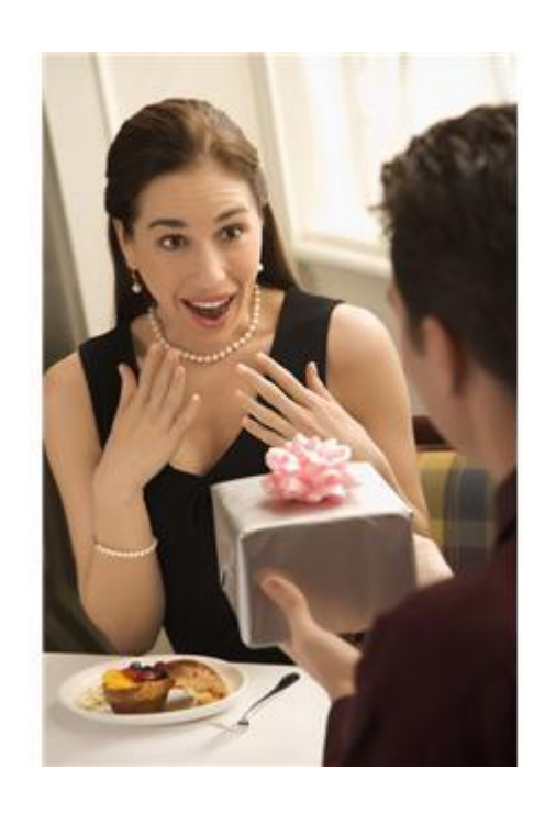
Can't Keep My Eyes Off You

Getting noticed is one way of building the percentages of raising awareness of the individuals' presence in the most convenient, pleasant and unassuming way. Using these methods will help to portray the person is a good light and thus encourage the approachability factor. For the male gender, this is very important on all levels which include the social and working environment.. Get all the info you need here.