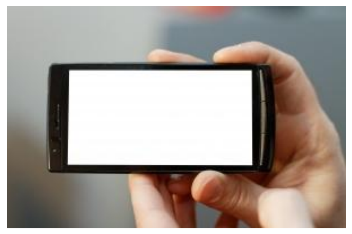
App Gangster Becoming The Godfather Of Smart Phone Apps

A good place to get ideas on phone apps is in social forums that target mobile users and developers. Many ideas as well as complaints are found in these forums. The complaints from users are great in terms of feedback as they will tell you what not to do with your app. Developers will also tell you what you should avoid when creating your app due to design complexity and programming tool restrictions. Most of these forums are free and you only need to register to participate in them.